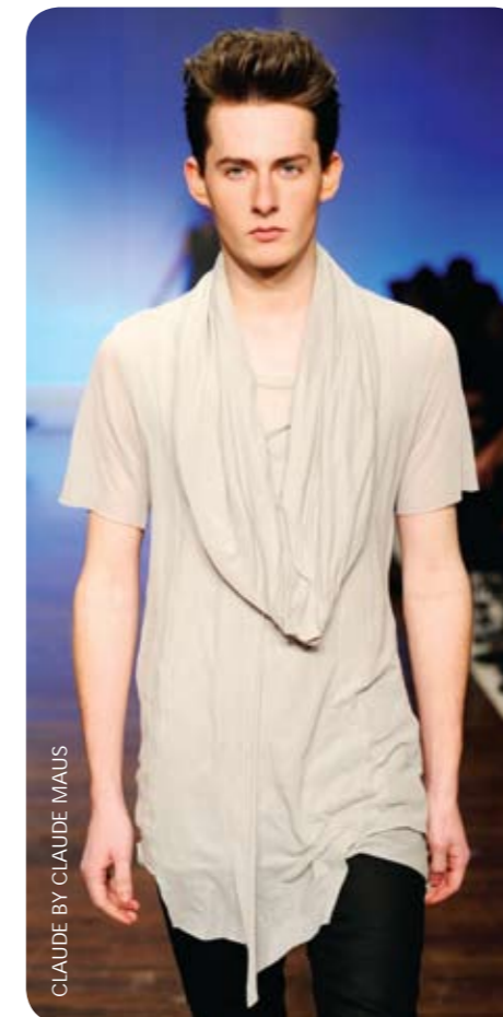
CLAUDE BY CLAUDE MAUS