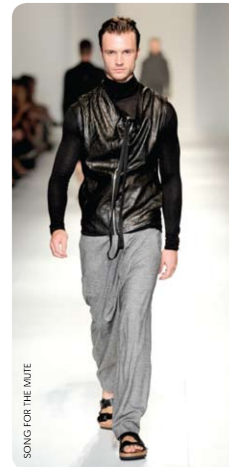
SONG FOR THE MUTE