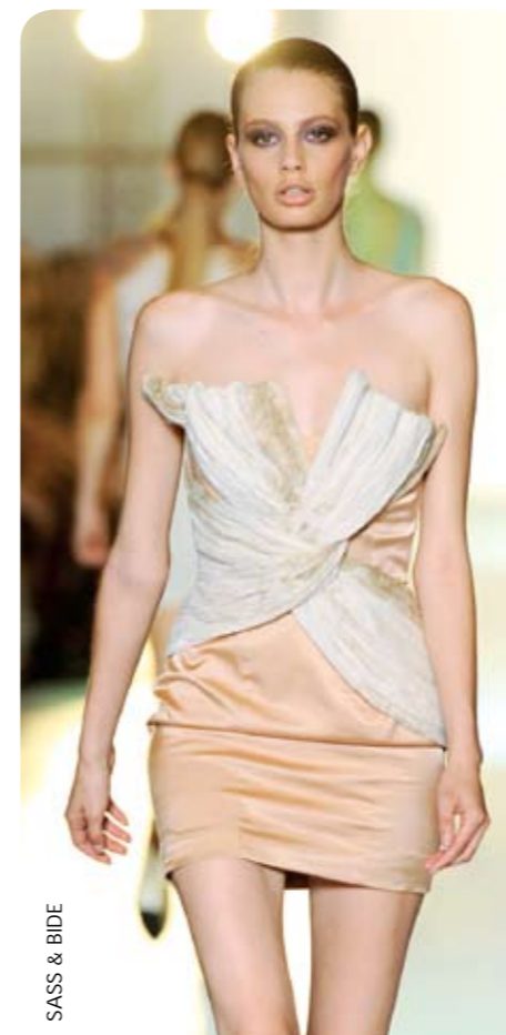
SASS & BIDE