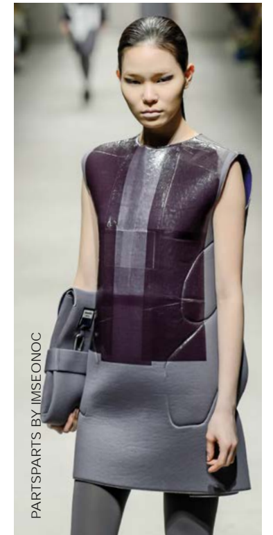
PARTSPARTS BY IMSEONOC