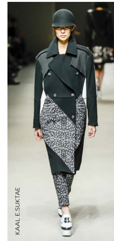
KAAL E SUKTAE