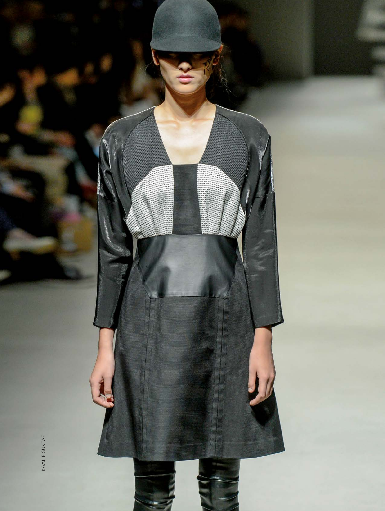
KAAL E SUKTAE